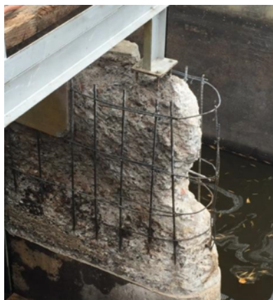
The dam was clearly deteriorated and repairs had become essential.